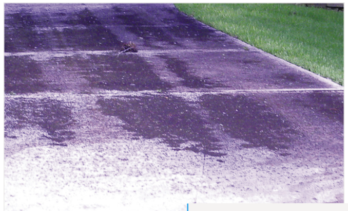
Figure 6. Frass on driveway