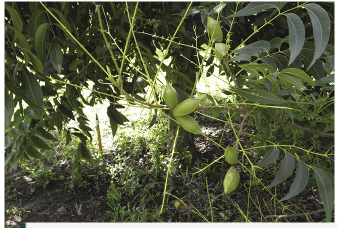
Figure 2. Branch terminals defoliated by walnut caterpillar

After approximately 9 days, larvae emerge from the eggs and begin feeding on the foliage. Young larvae skeletonize the leaf by feeding only on the leaf surface—older larvae consume the entire leaf, leaving only the leaf stalk or petiole (Fig. 2). Larvae feed for approximately 23 days, during which they go through five stages (instars).