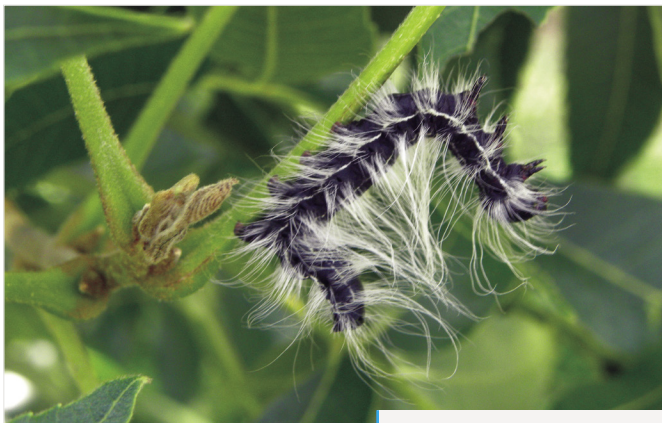
Figure 5. 5th instar larvae

In Texas, the walnut caterpillar can produce two or three generations per year depending on the number of frost-free days. Two generations are possible when there are fewer than 245 frost-free days—three generations are possible when there are more than 245 frost-free days.