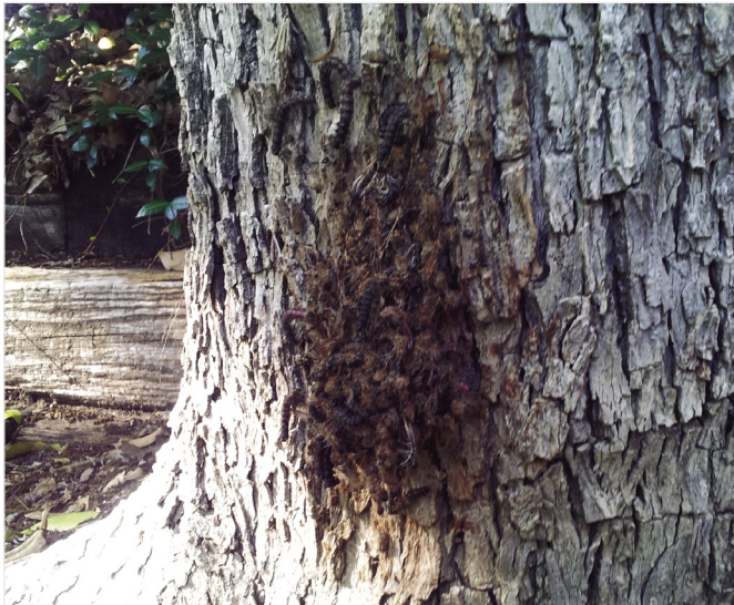
Figure 4. Cast skins from colony molt on side of tree trunk

The fifth instar larvae are black with long white hairs (Fig. 5), and after molting they return to the canopy to feed as individuals rather than as a colony. During this 3- to 5-day feeding period, 5th instar larvae consume about 80 percent of all the foliage they will eat in their lifetime. The larvae then leave the host plant to pupate in the soil.