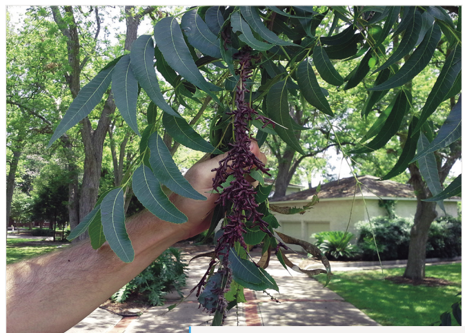
Figure 3. Colony of late instar larvae

Unlike the larvae of some leaf-feeding caterpillars, walnut caterpillar larvae do not build webs. During the first four larval stages, the reddish-brown larvae feed as a colony so damage will likely be localized on a few branches. It is common to find several hundred larvae feeding on a single terminal (Fig. 3). When the larvae are ready for the fifth instar, they move to a main limb or the tree trunk to molt as a group. This molt leaves a patch of cast skins on the tree trunk or limb (Fig. 4).