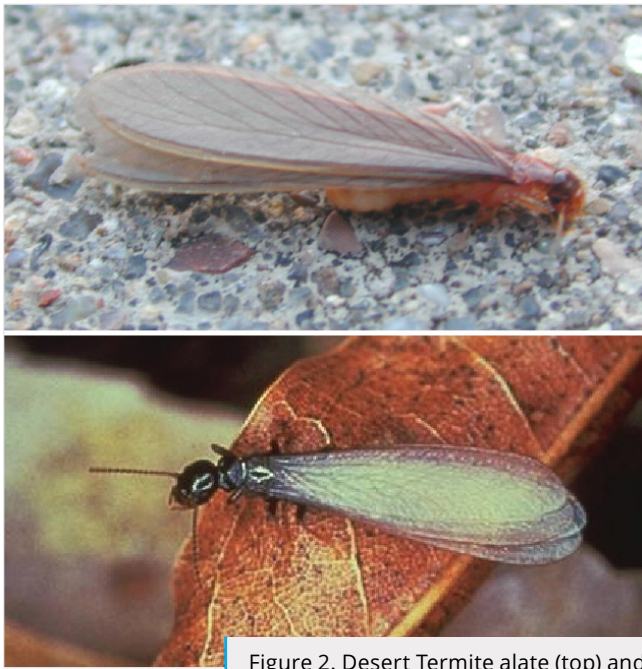
Figure 2. Desert Termite alate (top) and Subterranean Termite alate (bottom).

are transparent and the body dark brown to black (Fig. 2). Behavioral characteristics also can help with identification. A key difference is the time of day and season when they swarm. Desert termites frequently swarm just before sunset after a summer rainstorm. Subterranean termites often swarm during the day after rainfall from January through April.